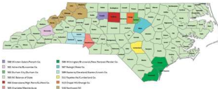
North Carolina Continuum of Care (CoC) Primary Areas

NC BoS CoC counties: Alamance, Alexander, Anson, Beaufort, Bertie, Bladen, Burke, Cabarrus, Caldwell, Camden, Carteret, Caswell, Catawba, Chatham, Cherokee, Chowan, Clay, Columbus, Craven, Currituck, Dare, Davidson, Davie, Duplin, Edgecombe, Franklin, Gates, Graham, Granville, Greene, Halifax, Harnett, Haywood, Henderson, Hertford, Hoke, Hyde, Iredell, Jackson, Johnston, Jones, Lee, Lenoir, Macon, Madison, Martin, McDowell, Montgomery, Moore, Nash, Northampton, Onslow, Pamlico, Pasquotank, Perquimans, Person, Pitt, Polk, Randolph, Richmond, Robeson, Rockingham, Rowan, Rutherford, Sampson, Scotland, Stanly, Stokes, Surry, Swain, Transylvania, Tyrell, Union, Vance, Warren, Washington, Wayne, Wilson, and Yadkin.